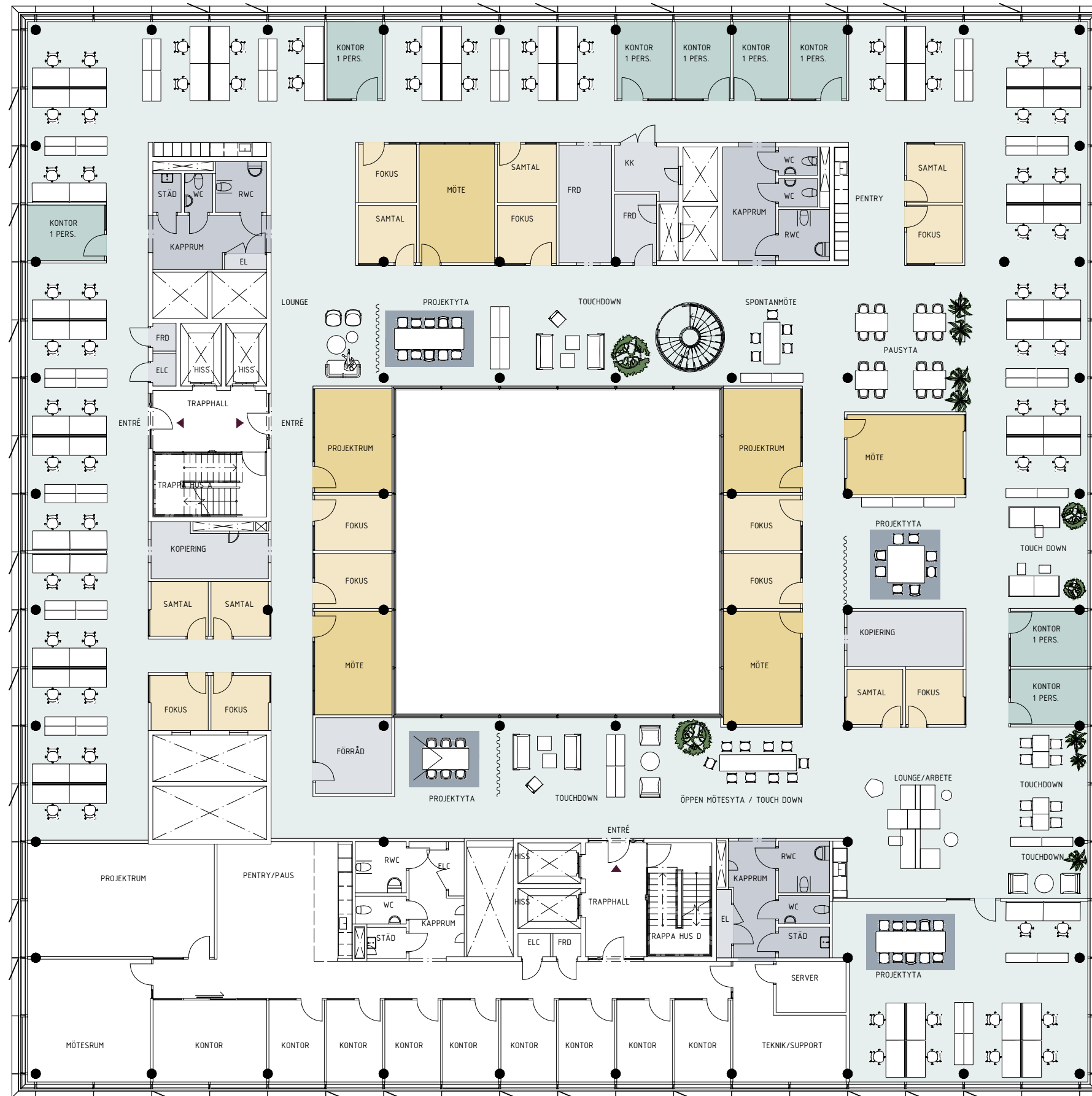
PLAN 02 Lokal 1455 kvm